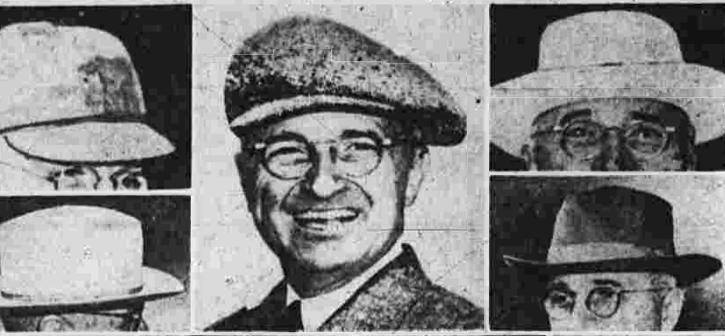
Twenty-five years ago President Truman started a haberdashery business in Kansas City, Mo., and lost his shirt—it took him 14 years to pay back a loss of $25,000.